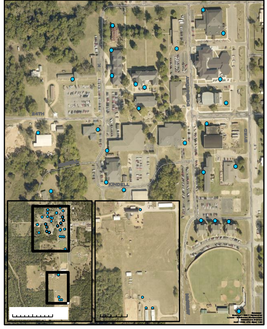
FIGURE 2. PROPOSED METER REPLACEMENT LOCATIONS ON THE MURRAY STATE COLLEGE CAMPUS

water supply infrastructure and a more accurate estimate of water demands that would provide significant savings associated with future operation of Tishomingo's new planned water treatment plant. Specific project milestones are provided in the Evaluation Criteria section.